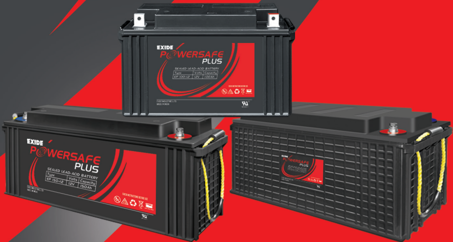
Sealed Maintenance Free VRLA Batteries